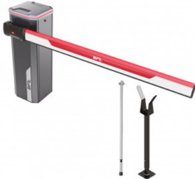
4m - BARRIER KIT